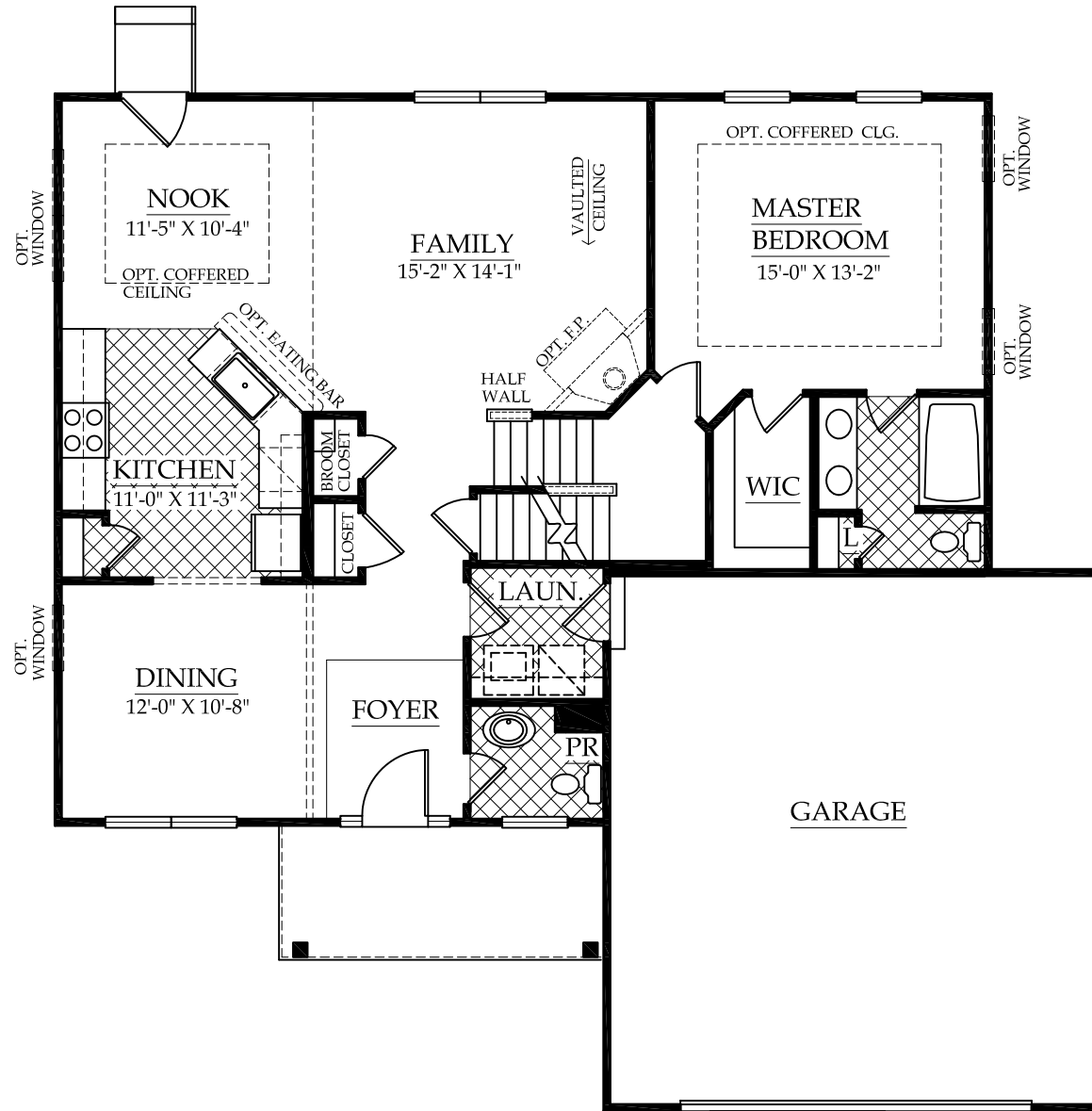
FIRST FLOOR PLAN 1224 SQ. FT.